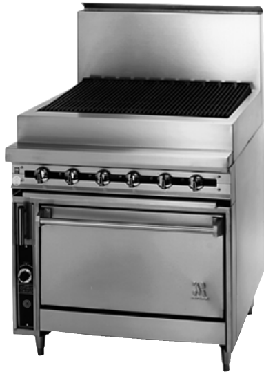
JTRH-36B-36 with optional high riser.